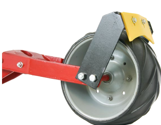
without Furrow V Closer