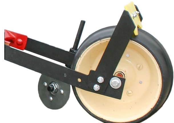
with Furrow V Closer