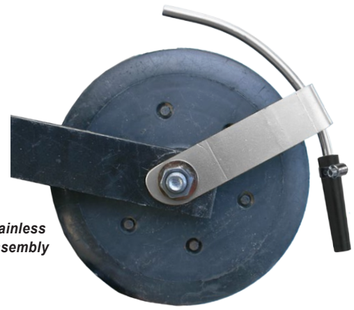
Left hand stainless steel tube assembly