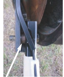
fig. (a) shows the spacer to use

OPTIONAL: Y-Not Split-It - use a 19/64th drill bit to drill a hole where the Y is inserted in the picture. Then heat the black hose and push Y into the black hose, then thread the black hose up through bottom and hole in FIN.