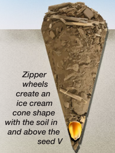
Zipper wheels create an ice cream cone shape with the soil in and above the seed V