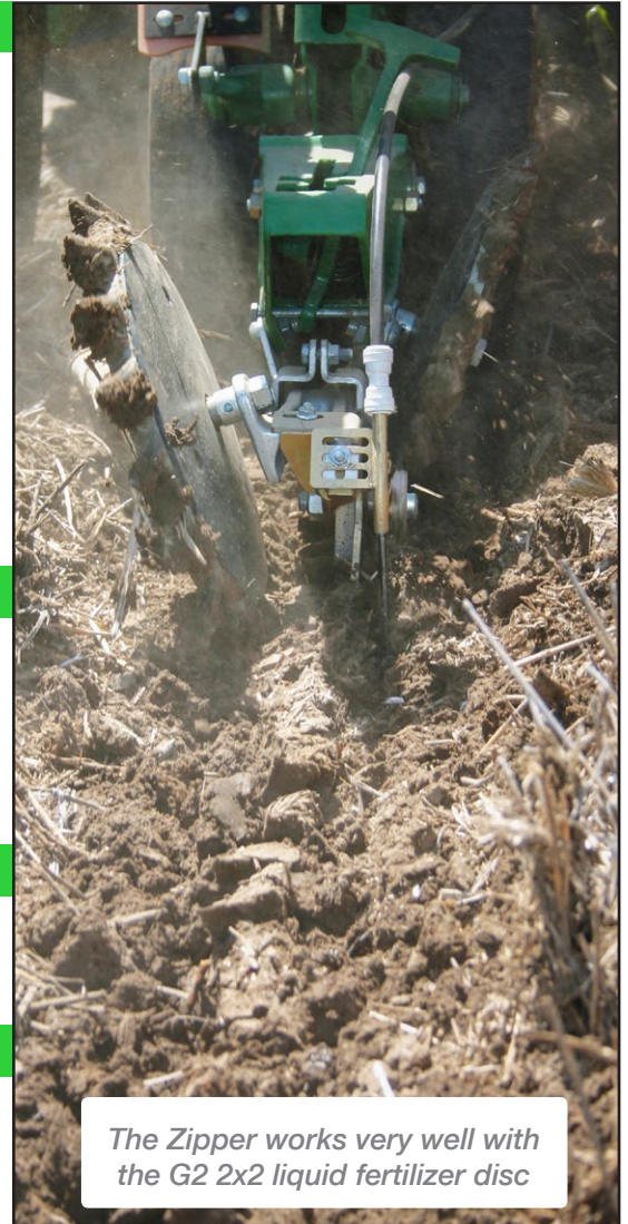
The Zipper works very well with the G2 2x2 liquid fertilizer disc